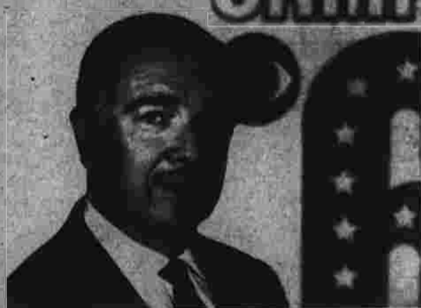
Waiter Cronkite will be anchorman for CBS.