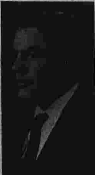
Kevin McCarthy in ABC's "Judd for the Defense," Friday 10-11 p.m.

Laugh and stay young. It is almost as good as chicken soup.